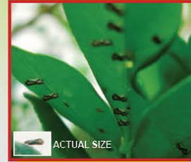
Adult psyllids feeding on young flush

ALL MUST work together to implement the Management Programme!