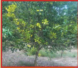
Citrus tree with 'Yellow Shoot'

Citrus greening disease can destroy the citrus industry!