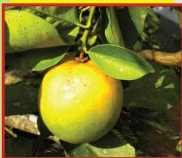
Colour inversion of fruit