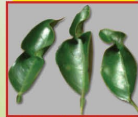
Notching of leaves caused by psyllid feeding