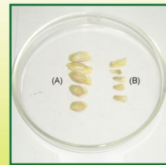
Normal seeds (A) and aborted seeds (B)