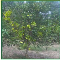
Citrus tree with 'Yellow Shoot'

Food and Agriculture Organization of the United Nations