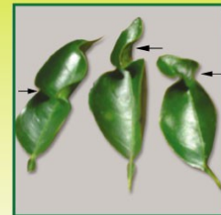
Notching of leaves caused by psyllid feeding