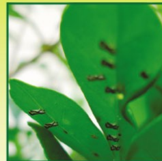
Adult psyllids feeding on young flush