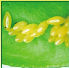
Psyllid eggs on young flush