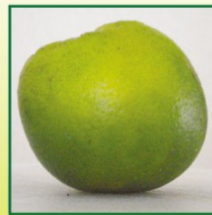
Navel fruit affected by greening