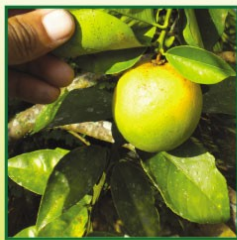
Colour inversion of fruit (ripening of fruit top to bottom)