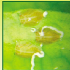
Psyllid nymph secreting honey dew