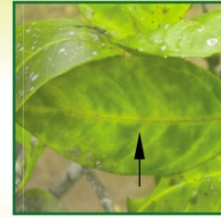
Corky raised mid-veins