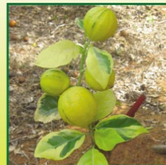
Chimera (Genetic disorder)