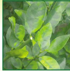
Classical blotchy mottle on lime