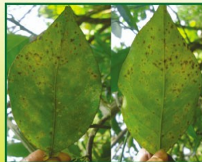
Greasy spot on both sides of leaves